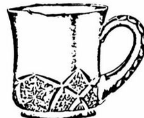
No. 2648 Mug Packed 23 1/2 dozen in a barrel Capacity, 4 ounces - Price, 65c per doz.

--From an old NEAR-CUT Catalog Check those fancy prices!!!