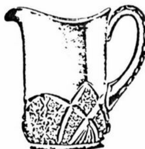
No. 2658 Individual Cream Packed 17 dozen in a barrel Price, 90c per doz. Capacity, 5 1/2 ounces

W. C. (Bill) Smith 4003 Old Columbus Road Springfield, Ohio 45502