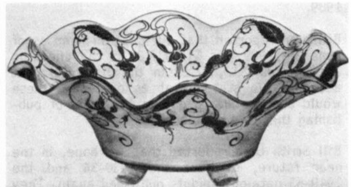
1349. 12 in. Bowl E/764