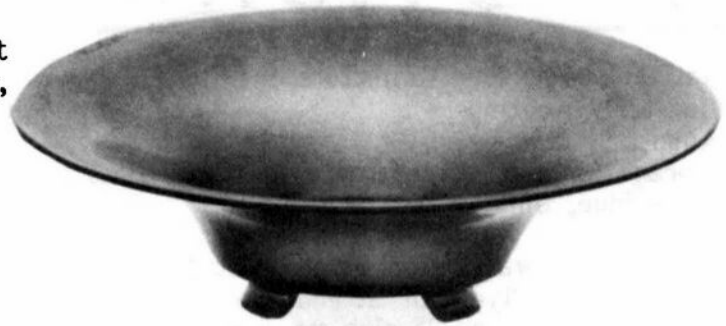
993-12 1/2" Bowl

All of these colored bobeches will be fitted with Crystal Prisms.