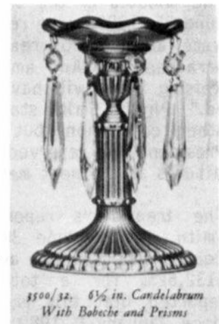
3500/32. 6 1/2 in. Candelabrum With Bobèche and Prisms

When we first listed these sets we had the Candlestick in dark colors only to match the bowls and as this candlestick is a rather heavy piece of glass it did not show to good advantage in the dark colors.