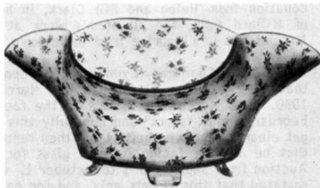
1348. 11 in. Bowl E/758