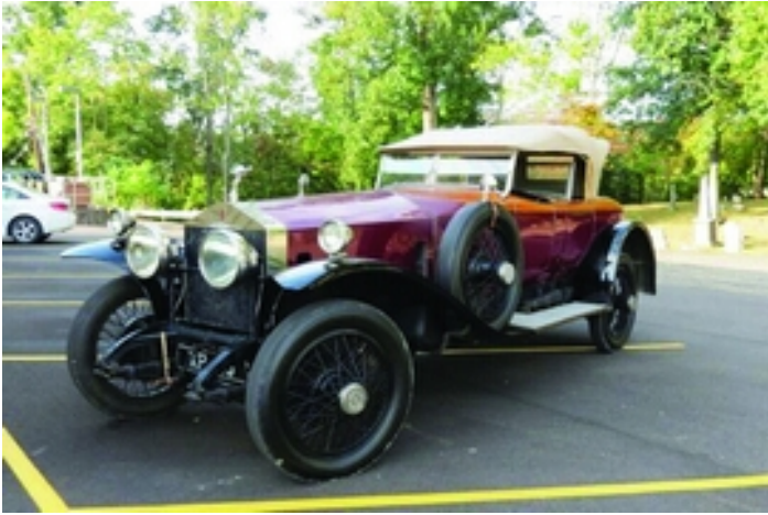
This 1923 Rolls Royce was parked in the lot behind the museum during the tour.