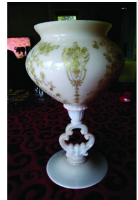
GE Rose Point Crown Tuscan 1305 10 1/2" globe vase with keyhole stem