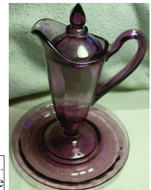
Amethyst 1917/384 – 5 oz. covered syrup and underplate