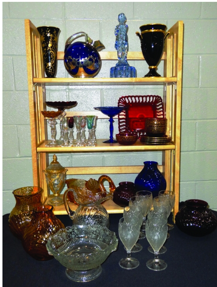
Glass included in the 2013 Museum Forever Raffle.