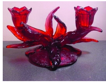
Everglade #3 two-lite candelabrum

I'm trying to focus on nice items that might make your gift shopping a little easier on the wallet. First up this month is a rarely seen Pristine 485 – 9 1/2" crescent salad plate. This one left the table for $115.50. An elegant crystal 278 – 11" vase with a Wallace Sterling base sold for $147. Perfect for the holidays, a gorgeous P427 – 10" salad bowl with pierced Rose Point Wallace Sterling foot ended at $230. A GE Crown Tuscan 1305 10 1/2" globe vase with keyhole stem ended at $185.50.