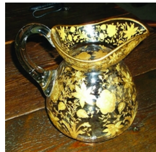
GE Wildflower 3400/141 – 76 oz. Jug

A 3011 – 7" flared comport with Carmen top and crystal stem and foot was packed onto Santa's sleigh for $121.50.