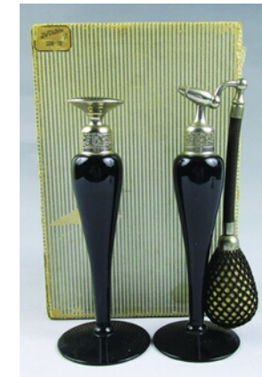
Boxed set (original box in good condition) of Ebony Devilbiss Atomizer and Perfume

A pair of 3121 – 1 oz. Portia cordials ended at $22.72. A lovely GE Elaine 1402/100 goblet sold for $31.01. A very nice Roselyn P306 covered candy sweetened someone's day for $47.87. Ready for the holiday parties, an Elaine 3400/175 – cocktail shaker with chrome top was shaken, not stirred for $50. A stunning heavily GE Wildflower 3400/141 – 76 oz. Jug made its way down the chimney for $161.90. This next beauty was on everyone's list. A rare Pink w/Gold trim 3400/17 – 12" vase with the rarely seen Windsor (Castle) etching was won after a terrific battle for $536.99.