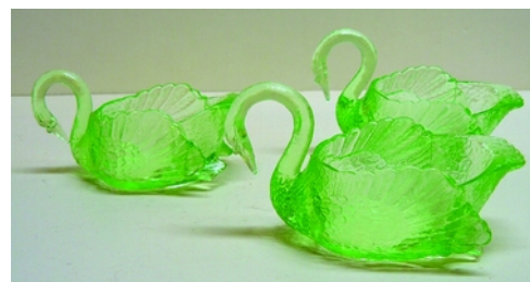
4 1/2" (Style 1) Lt Emerald swans