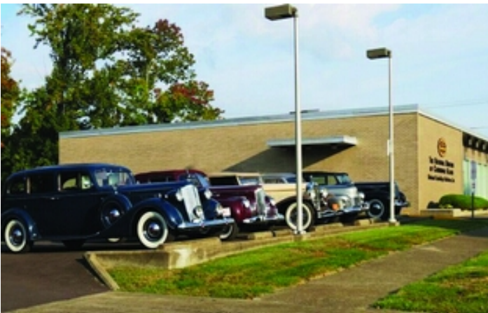
The front row in the museum parking lot filled with spectacular classic cars.