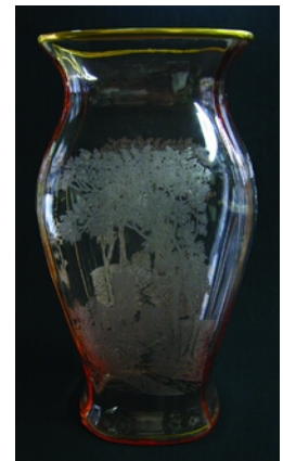
3400/17 – 12" vase with the rarely seen Windsor (Castle) etch