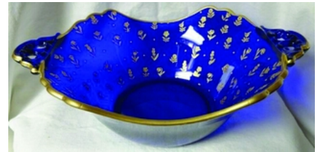
Royal Blue 2 handled bowl GE Chintz