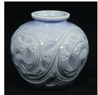
Violet Everglade #23 - 5" Vase