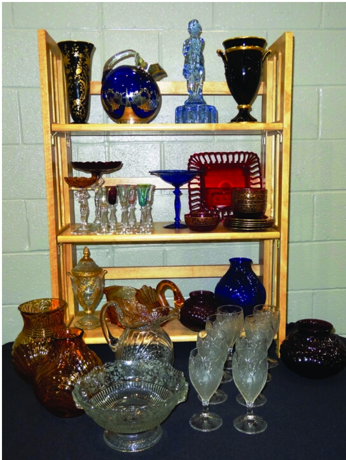
Glass included in the 2013 Museum Forever Raffle.