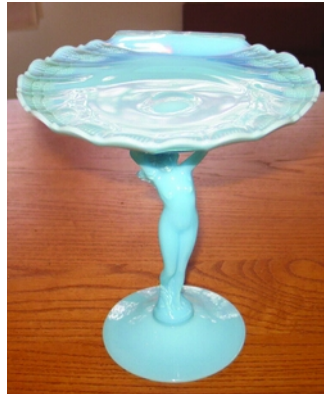
Shell (SS11) comport in Windsor Blue