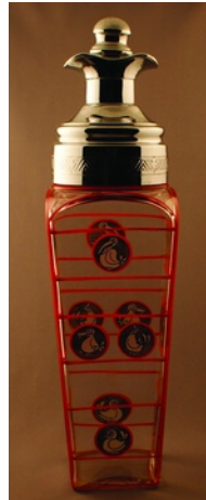
1020 - 34 oz. Cocktail Shaker with the 2-lip Chrome Top, beautifully enameled in the very desirable D/986 Wise, Otherwise, Theorize, Harmonize decoration