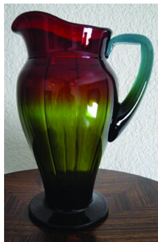
Rubina No. 550 - 48 oz. Pitcher