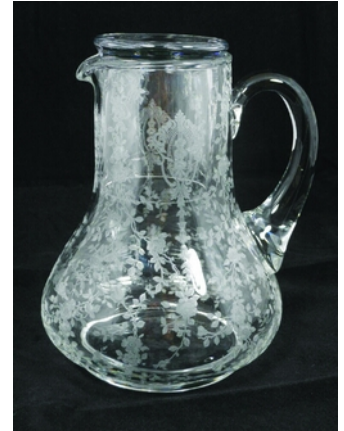
No. 103 Guest Room Jug and Tumbler