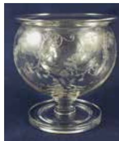
#18 Pristine Etched Elaine