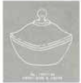
No. P.101 10 1/2" BOWL