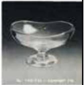
No. P.102 14" BOWL