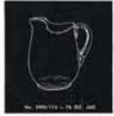
No. P.102 14" BOWL