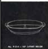
No. P.101 10 1/2" BOWL