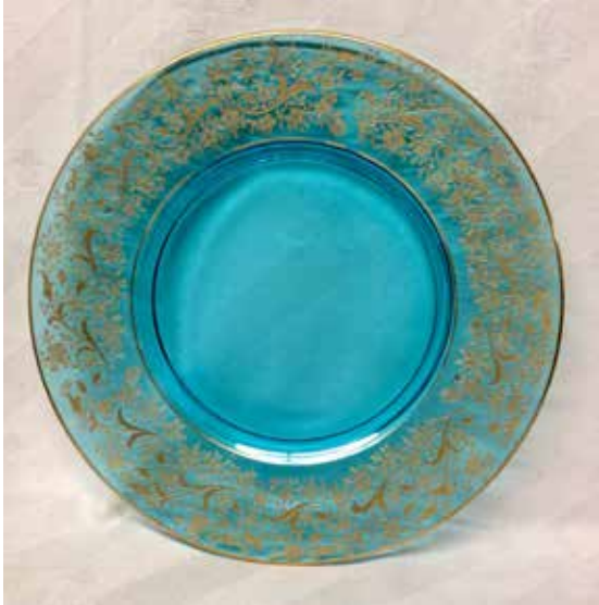
Bluebell 10.25 dinner plates gold encrusted E719