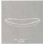
No. P.100 13" BOWL