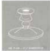
No. P.148 7 1/2" CANDLESTICK