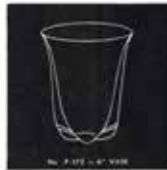
No. P.172 4 1/2" VASE