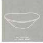
No. P.100 13" BOWL