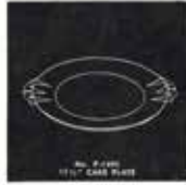
No. P.100 12 1/2" PLATE