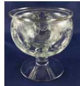
#3600 Etched Elaine