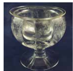
3900/18 Etched Elaine

Until next time, share your enjoyment and enthusiasm of Cambridge glass!