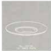
No. P.107 12" PLATE