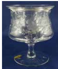
#968 RCE Lucia 824

• I don't know why, but I think cocktail (shrimp) icers are just plain cool. Although I've never used one. And I love shrimp! Bonus extra! The #3900/18 is just an optic version of the #3600. Cambridge did that many times. They'd take non-optic pieces from other lines, make them optic and put them in the #3900 line. Look at the #3900 line and see how many of these you can identify.