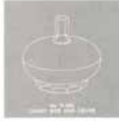
No. P.100 13" BOWL