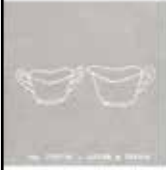
No. P.101 10 1/2" BOWL