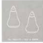
No. P.172 12" VASE