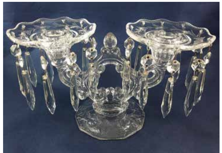
1268 - 6 ½ in. 2-Lite Candelabrum, RCE 560