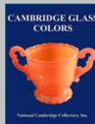
Cambridge Glass Colors

The following books can be purchased on Amazon and downloaded to your Kindle device