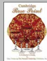
Cambridge Rose Point