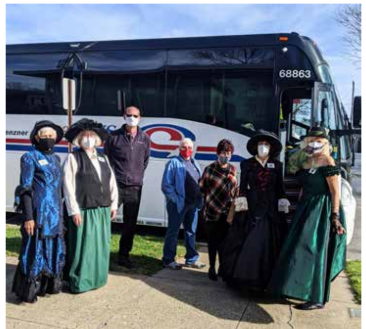
The number of passengers on each of our motorcoach groups this year was about half of what usually arrives. They were all very polite and enjoyed the National Museum of Cambridge Glass.