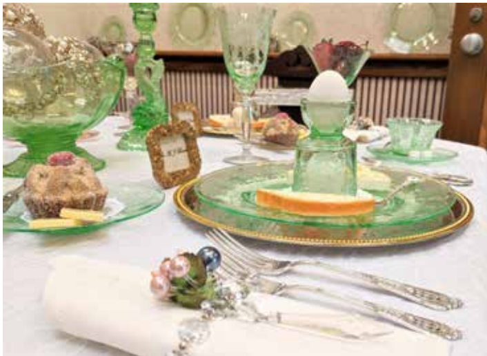
The new Museum Dining Room display features the No. 748 – 5 oz. Double Egg Cups in Light Emerald, Gold Krystal and Willow Blue.

The new Museum Dining Room, “ A Christmas Brunch with Cambridge ” was in place for the holiday season with great reviews. The inspiration for the display came from the donation of a Light Emerald double egg cup etched Apple Blossom from Ann Stotzer. The four place settings are; Willow Blue, Gold Krystal, Peach Blo and Light Emerald. We do not have the double egg cup in Peach Blo, so if you ever happen to see one, please let me know.