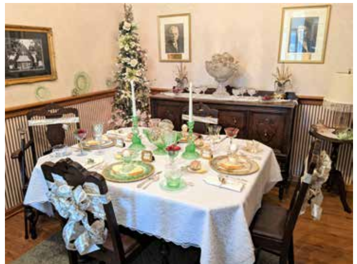
There have been many positive comments about the new Dining Room. Most people say how they would love to be entertained in the room.

Wishing you a Safe, Healthy & Happy New Year!